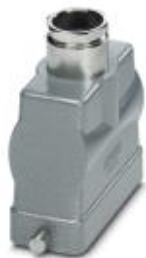
HEAVYCON B16 sleeve housing, for single locking latch, height: 76 mm, with 1 x Pg21 screw connection, straight cable outlet

Please be informed that the data shown in this PDF Document is generated from our Online Catalog. Please find the complete data in the user's documentation. Our General Terms of Use for Downloads are valid ( http://phoenixcontact.com/download )