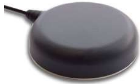
TW2600 Dimensions (mm)

The TW2600 is housed in a compact, industrial-grade weather-proof, magnet mount enclosure, with threaded base holes for screw down attach.