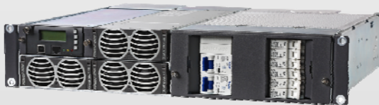
6 kW in 19", 2 RU with Controller, Load & Battery Distribution

These compact rectifiers support up to 10 kW in a 1RU 23" shelf. A wide variety of distribution options are available to provide the maximum system flexibility for a wide range of communications applications that demand efficiency, reliability, and flexibility including wireless base stations, remote switches, and broadband access.