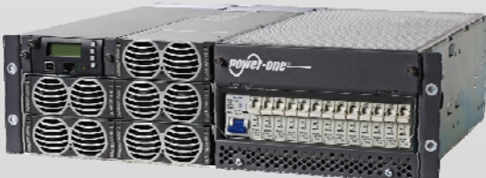
10 kW in 19", 3 RU with Controller, Load & Battery Distribution