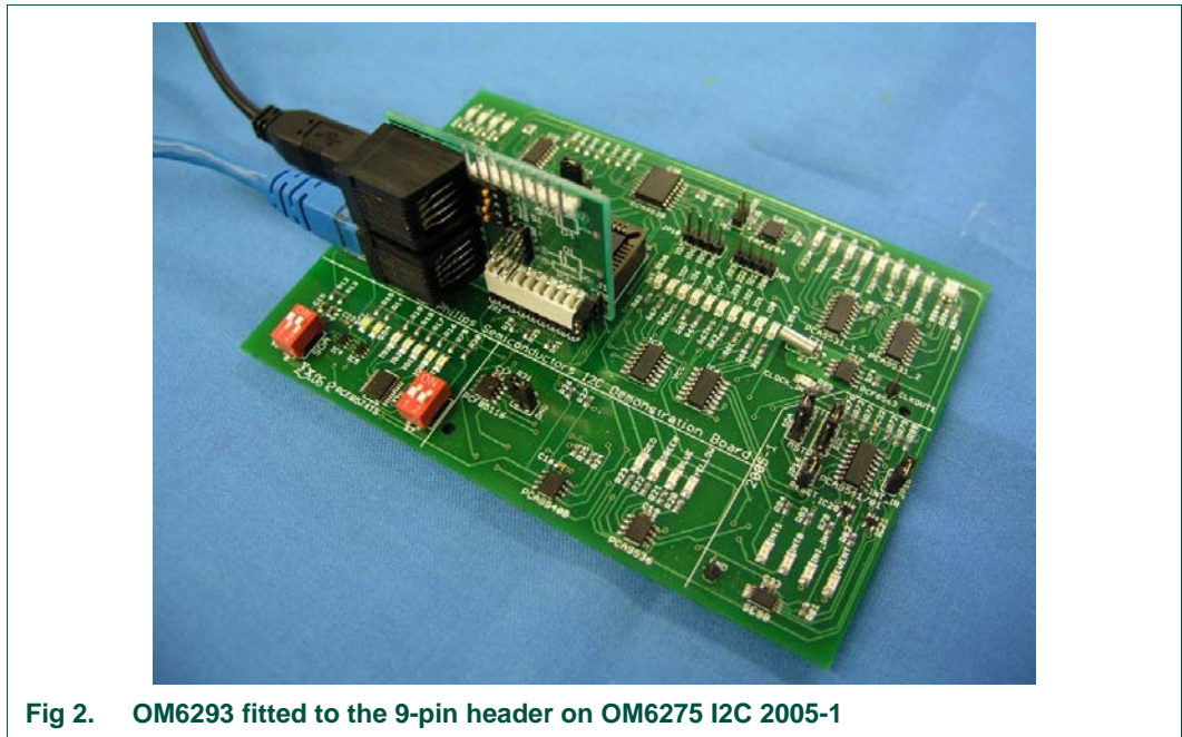
Fig 2. OM6293 fitted to the 9-pin header on OM6275 I2C 2005-1