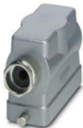
HEAVYCON B16 sleeve housing, for single locking latch, height: 76 mm, with 1 x Pg29 screw connection, lateral cable outlet

Please be informed that the data shown in this PDF Document is generated from our Online Catalog. Please find the complete data in the user's documentation. Our General Terms of Use for Downloads are valid ( http://phoenixcontact.com/download )