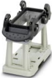
HEAVYCON connector assembly frame with panel mounting base with double locking latch, for contact inserts of type B24, 150 mm long

Please be informed that the data shown in this PDF Document is generated from our Online Catalog. Please find the complete data in the user's documentation. Our General Terms of Use for Downloads are valid ( http://download.phoenixcontact.com )