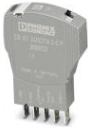
Electronic device circuit breaker, 1-pos., active current limitation, status output and control input, plug for base element.

Please be informed that the data shown in this PDF Document is generated from our Online Catalog. Please find the complete data in the user's documentation. Our General Terms of Use for Downloads are valid ( http://download.phoenixcontact.com )