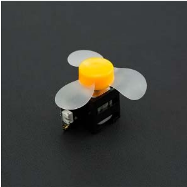
Gravity: 130 DC Motor