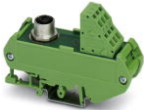
VARIOFACE module, with spring-cage terminal blocks and M12-SAC socket, 5-pos.

Please be informed that the data shown in this PDF Document is generated from our Online Catalog. Please find the complete data in the user's documentation. Our General Terms of Use for Downloads are valid ( http://phoenixcontact.com/download )