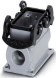
HEAVYCON box mounting base B10, with double locking latch, height 74 mm, with support 2 x M25

Please be informed that the data shown in this PDF Document is generated from our Online Catalog. Please find the complete data in the user's documentation. Our General Terms of Use for Downloads are valid ( http://phoenixcontact.com/download )