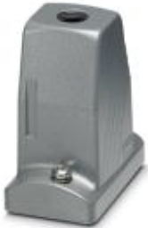
HEAVYCON ADVANCE standard powder-coated sleeve housing B6, with screw locking, height 100 mm, with 1xM20 thread, straight cable outlet

Please be informed that the data shown in this PDF Document is generated from our Online Catalog. Please find the complete data in the user's documentation. Our General Terms of Use for Downloads are valid ( http://download.phoenixcontact.com )