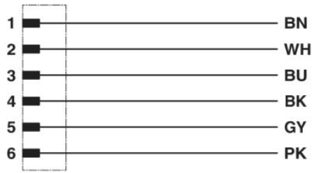
Contact assignment of the M8 plug