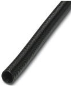
Polyamide protective hose, inflammability class V0, UV resistant

Please be informed that the data shown in this PDF Document is generated from our Online Catalog. Please find the complete data in the user's documentation. Our General Terms of Use for Downloads are valid ( http://phoenixcontact.com/download )