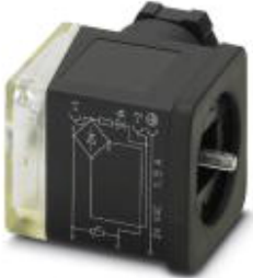
Valve connector, 3-pos., construction A, 1 LED, with protective circuit: varistor and rectifier, screw connection, M16 cable gland

Please be informed that the data shown in this PDF Document is generated from our Online Catalog. Please find the complete data in the user's documentation. Our General Terms of Use for Downloads are valid ( http://download.phoenixcontact.com )