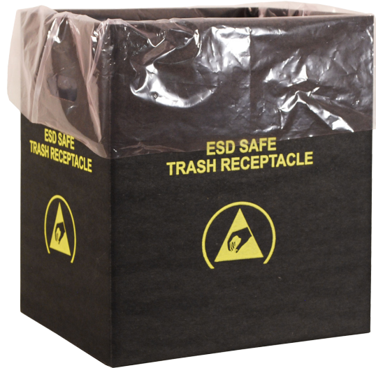
Trash receptacle with liner Receptacle sold separately