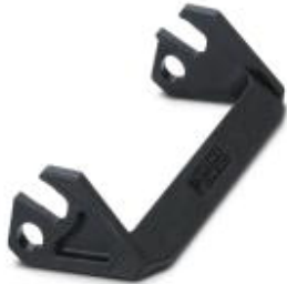
Replacement single locking latch for HEAVYCON EVO housing type B24, PA

Please be informed that the data shown in this PDF Document is generated from our Online Catalog. Please find the complete data in the user's documentation. Our General Terms of Use for Downloads are valid ( http://phoenixcontact.com/download )