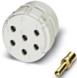
Contact insert, Number of positions: 6, Type of contact: Male connector, Crimp connection

Please be informed that the data shown in this PDF Document is generated from our Online Catalog. Please find the complete data in the user's documentation. Our General Terms of Use for Downloads are valid ( http://phoenixcontact.com/download )