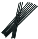
ThermoFlex™ Welding Rods 12" x 1.1" x 0.6" No. 07352