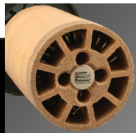
DuraTherm™ Heating Element