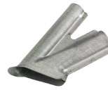
Plastic Welding Nozzle 2.0" x 1.3" x .4" No. 07091