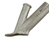
Welding Nozzle 2.6" x 1.2" x .5" No. 07531