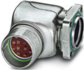
The figure shows the 12-pos. product version

Device connector, front mounting, angled rotatable, Screw locking, M23, Number of positions: 17, Type of contact: Socket, Crimp connection, Axial O-ring, 4xØ3,2, Shielded: Yes, Flange dimensions: 28 mm x 28 mm