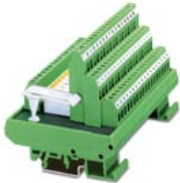
VARIOFACE module, for mounting on NS 35/7.5 or NS 32, for connecting 8 proximity switches

Please be informed that the data shown in this PDF Document is generated from our Online Catalog. Please find the complete data in the user's documentation. Our General Terms of Use for Downloads are valid ( http://phoenixcontact.com/download )