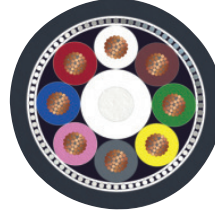
PUR halogen-free black shielded [PUR]