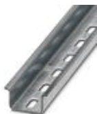
DIN rail, material: Galvanized, perforated, height 15 mm, width 35 mm, length: 2 m

DIN rail perforated - NS 35/15 ZN PERF 2000MM - 1206599