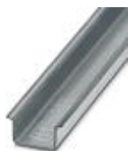
DIN rail, material: Galvanized, unperforated, height 15 mm, width 35 mm, length: 2 m

DIN rail, unperforated - NS 35/15 ZN UNPERF 2000MM - 1206586