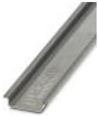
DIN rail, unperforated, Width: 35 mm, Height: 7.5 mm, Length: 2000 mm, Color: silver

DIN rail, unperforated - NS 35/ 7,5 AL UNPERF 2000MM - 0801704