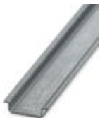
DIN rail, material: Galvanized, unperforated, height 7.5 mm, width 35 mm, length: 2 m

DIN rail, unperforated - NS 35/ 7,5 ZN UNPERF 2000MM - 1206434