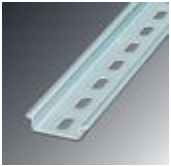
DIN rail 35 mm (NS 35)

DIN rail perforated - NS 35/ 7,5 WH PERF 2000MM - 1204119