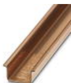
DIN rail, material: Copper, unperforated, 1.5 mm thick, height 15 mm, width 35 mm, length: 2 m

DIN rail, unperforated - NS 35/15 CU UNPERF 2000MM - 1201895