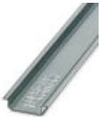
DIN rail 35 mm (NS 35)

DIN rail - NS 35/ 7,5 WH UNPERF 2000MM - 1204122