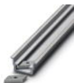
DIN rail, deep drawn, high profile, unperforated, 1.5 mm thick, material: aluminum, height 15 mm, width 35 mm, length 2000 mm

DIN rail, unperforated - NS 35/15 AL UNPERF 2000MM - 1201756