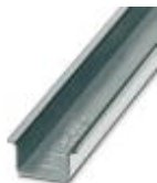
DIN rail 35 mm (NS 35)

DIN rail - NS 35/15 WH UNPERF 2000MM - 1204135