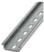
DIN rail, material: Galvanized, perforated, height 7.5 mm, width 35 mm, length: 2 m

DIN rail perforated - NS 35/ 7,5 ZN PERF 2000MM - 1206421