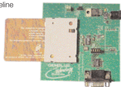
AT83C21GC Reference Design