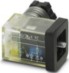
Valve connector, 3-pos., construction CI, 1 LED, with protective circuit, screw connection, M12 cable gland

Please be informed that the data shown in this PDF Document is generated from our Online Catalog. Please find the complete data in the user's documentation. Our General Terms of Use for Downloads are valid ( http://download.phoenixcontact.com )