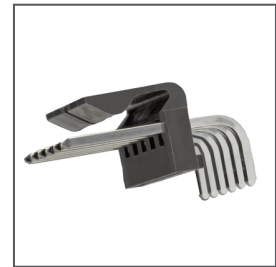
KK® 396 RPC Vertical and Right-Angle Headers with Friction Lock