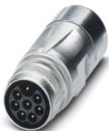
Coupler connector, straight, SPEEDCON locking, M17, Number of positions: 5+3+PE, Type of contact: Pin, Crimp connection, shielded: yes, Cable diameter: 9 mm...11.2 mm

Please be informed that the data shown in this PDF Document is generated from our Online Catalog. Please find the complete data in the user's documentation. Our General Terms of Use for Downloads are valid ( http://phoenixcontact.com/download )