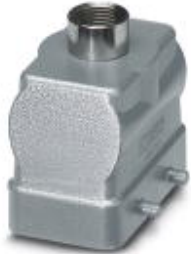
HEAVYCON B10 sleeve housing, for double locking latch, height: 56 mm, with 1 x Pg16 gland, straight cable outlet

Please be informed that the data shown in this PDF Document is generated from our Online Catalog. Please find the complete data in the user's documentation. Our General Terms of Use for Downloads are valid ( http://download.phoenixcontact.com )