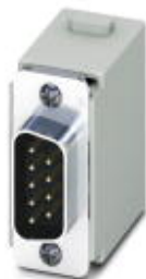
Contact insert module, Number of positions: 9, Type: D-SUB-9, Pin, Crimp connection, 50 V, 1 A, 0.08 mm² ... 0.5 mm², Application: Data

Please be informed that the data shown in this PDF Document is generated from our Online Catalog. Please find the complete data in the user's documentation. Our General Terms of Use for Downloads are valid ( http://phoenixcontact.com/download )