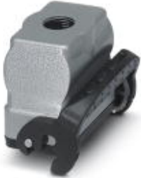
HEAVYCON B6 coupling housing, with single locking latch, height: 62 mm, with 1 x M20 thread, straight cable outlet

Please be informed that the data shown in this PDF Document is generated from our Online Catalog. Please find the complete data in the user's documentation. Our General Terms of Use for Downloads are valid ( http://phoenixcontact.com/download )